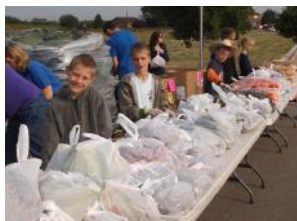
HC students serving at the September Care & Share

Join us as we serve the needy of Colorado Springs with the Care and Share Mobile Food Pantry the second Friday of every month. New dates will be available soon!